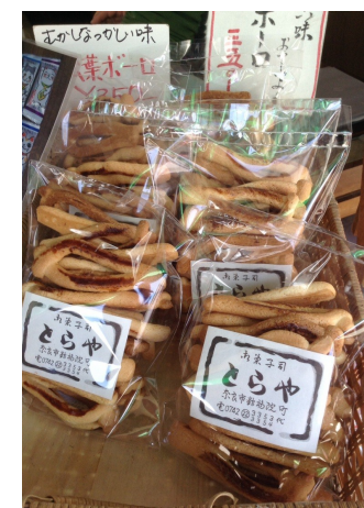
Matsuba bolo ¥ 350

Sweets, white beans with persimmon jams, sweet smell.