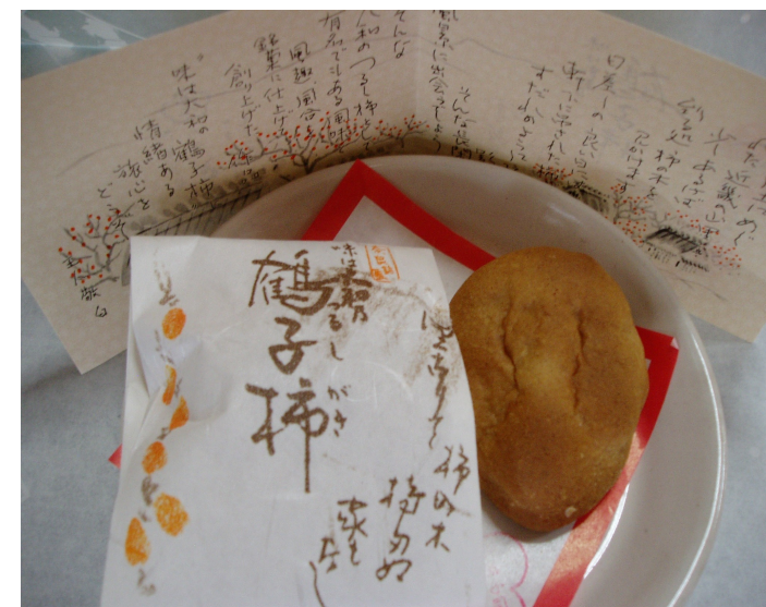
Tsurushigaki each ¥ 220

※We can write a special message as you want. Only parent cat bolo. (Please contact us)