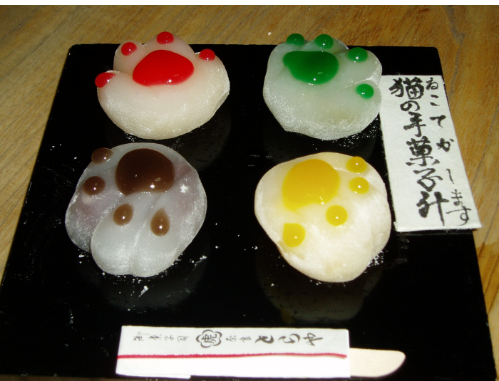
neko no te kashimasu cat's hand each ¥ 240

Surely you addict to the cat's palm! Once eating, you get luck up!?