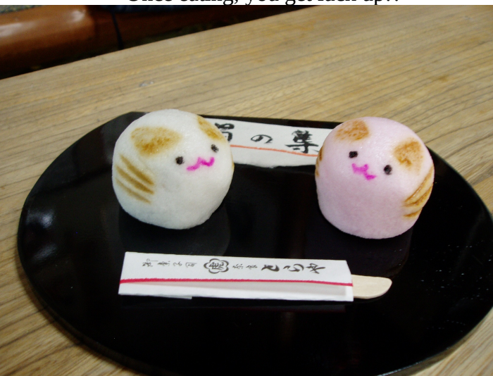
neko no shuukai cats' meeting each ¥ 240

Surely you addict to the cat's palm! Once eating, you get luck up!?