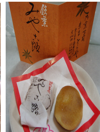
Miyakoji ¥ 100

We have other sweets. Please show our hp for details